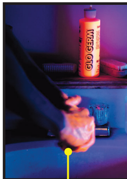
After being washed, they are placed under a black light again.