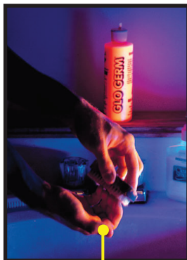
Using plenty of soap and a scrub brush—hands are washed.