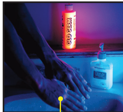
It is evident where they were not washed properly—most commonly missed areas are around the fingernails and between the fingers.

fluorescers. Because all clothing contains residual detergent, some types of clothing may appear to be especially brilliant in bright sunshine, which is more than 10% UV light.