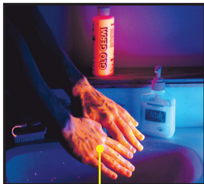
When placed under a black light, hands covered in Glo Germ oil glow a brilliant orange.